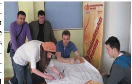
Training in Zepce

Workshops: USAID's "YouthBanks" project has held 48 workshops on how to mobilize local resources. Nearly 1,000 youth from 10 municipalities took part in these workshops. The YouthBanks project brings together mixed ethnic youth groups to participate as active citizens in their multi-ethnic communities. Through community-based reconciliation, social cohesion will strengthen and social capital will increase.